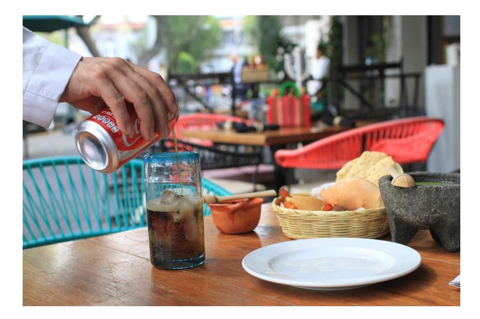
Figure 4. "A waiter pours a Coca-Cola in Mexico City's Colonia Roma." (Forbes 2016; cited above). The coexistence of Coca-Cola with a commodified "local" mortar ( un molcajete ) in an ostensibly high-end restaurant is exemplary of the globalism of historic downtown.

contradistinction with Santa Fe) and a kind of global humanistic responsibility. Catering to the tourism industry is of course a key factor in this commodification of national heritage for "global" consumption, as the ultimate target of much of Guiliani's reforms turned out to be the centers of tourism. Despite the claims and rhetoric of Guiliani, Slim, and other elite actors involved in this "rescue" mission, we will see that the primary goals of the solicitation of Guiliani were profit and development rather than actually addressing problems with crime or the police.