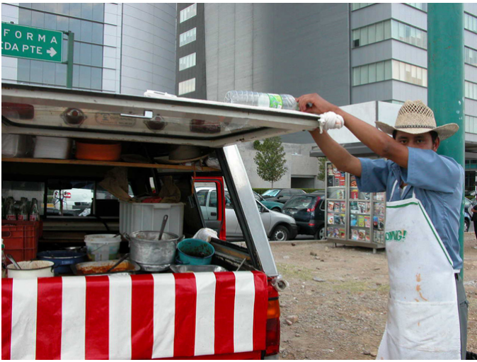
Figure 2 . "Food 'stand' in Santa Fe © Courtesy of Maria Moreno-Carranco." (accessed via http://www.mascontext.com/issues/3-work-fall-09/publics-works/)