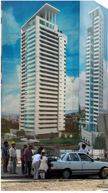
Figure 3. Construction workers buying lunch in Santa Fe